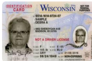
Sample Identification Card